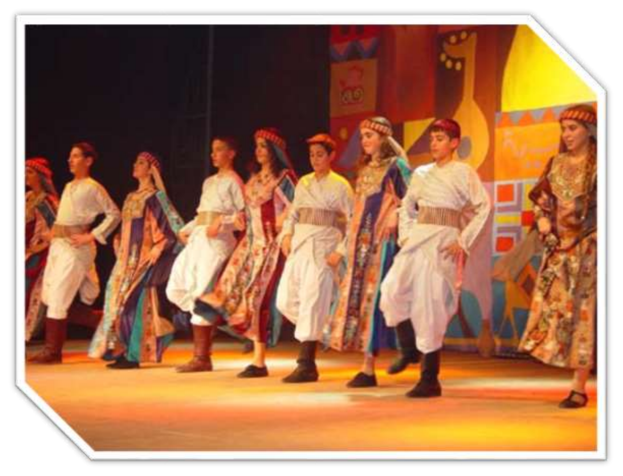
Traditional Arabic dancing called Debke